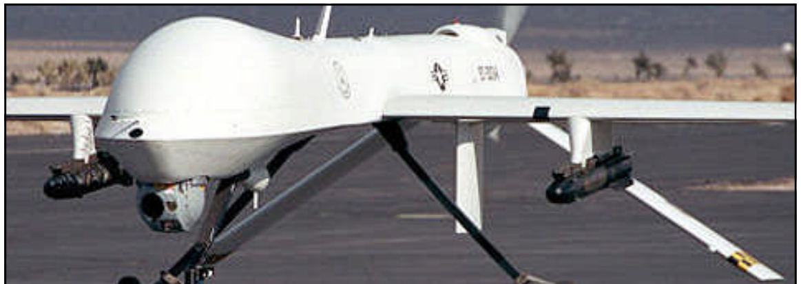
Hellfire Predator, U.S. weapon of choice in Afghanistan.

After WWII, with military strategists at last perceiving the many advantages of UAVs, the U.S. began to invest heavily in their development. In May 1960, U2 spy plane pilot Francis Gary Powers was shot down over the Soviet Union, which further encouraged the development of unmanned surveillance aircraft, this time under the code name of "Red Wagon." Camera-carrying drones were used widely for surveillance operations in the Vietnam War, the first Gulf War (1990-91), the Balkans conflicts of the 1990s, and in many subsequent theaters. By 2000 the United States was ready to use drones extensively as launch vehicles for missiles, and in 2001 the Afghans began to feel the benefits. On Nov. 3, 2002, C.I.A. operatives in Djibouti fired laser-guided Hellfire missiles from a drone at a passenger vehicle in Yemen, killing all the